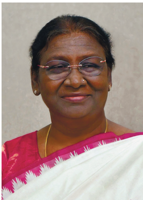
President Droupadi Murmu

Over the past year, there has been excellent momentum in the high-level engagements between India and Japan. The Hon. Prime Minister Narendra Modi met with the Hon. Prime Minister Shigeru Ishiba on the sidelines of the East Asia summit in Laos. Prior to that, there were summit-level meetings on the sidelines of the summit of the group of seven leading industrial nations in Italy and the Quad meeting in the United States.