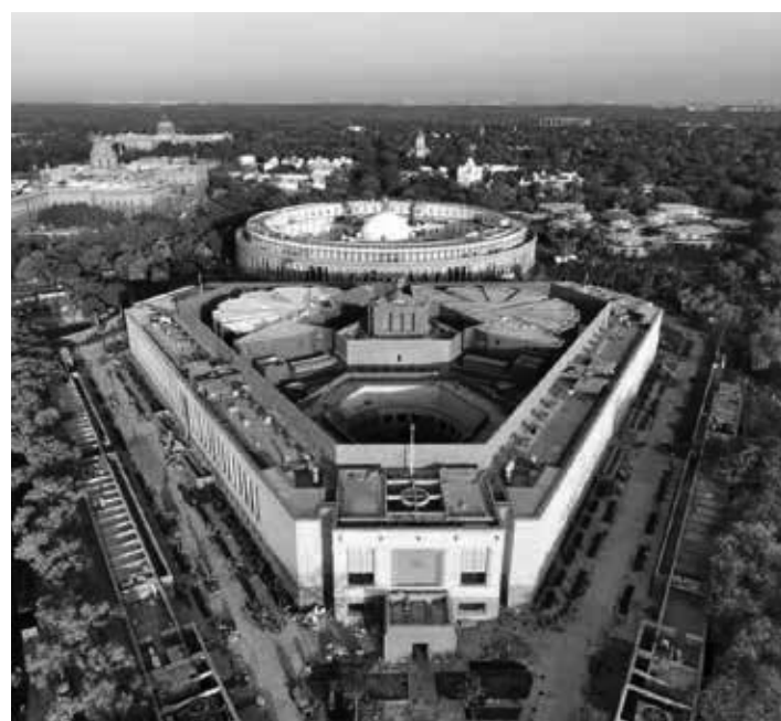
India's Parliament House in New Delhi was inaugurated in 2023. INCREDIBLE INDIA

The Indian Commerce and Industry Association Japan, with a history spanning over 104 years, serves as an apex body providing support, guidance and advisory services to all interested parties, enabling them to fully develop the economic potential and investment opportunities between Japan and India. On behalf of all ICJ members, I convey our deepest appreciation to the readers of The Japan Times.