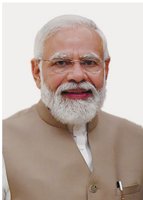
Prime Minister Narendra Modi

Our defense and security cooperation is a shining example of the significant progress in our bilateral partnership, with increased joint exercises and exchanges. Our defense chiefs met on the sidelines of the Association of Southeast Asian Nations defense ministers' meeting in Laos. The discussions at the "two-plus-two" foreign and defense ministerial dialogue in New Delhi,