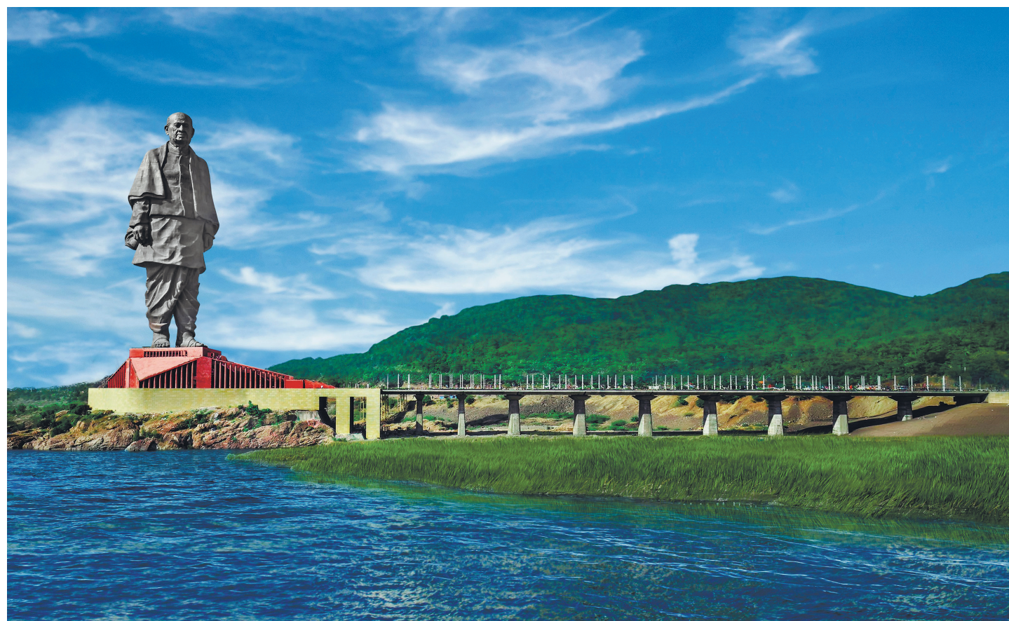
Honoring Indian politician and independence activist Sardar Patel, the Statue of Unity in Gujarat is the world's tallest, standing 182 meters. INCREDIBLE INDIA

One of the highlights of our progressive partnership this past year was the inaugural India-Japan economic security dialogue, including strategic trade and technology, held in Tokyo. There is recognition of a need to closely collaborate to protect economic interests and build resilient supply chains in an unpredictable geopolitical environment. This dialogue also provided an excellent opportunity to promote col-