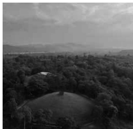
The Charaideo Maidams burial mounds are India's 43rd UNESCO World Heritage Site. INCREDIBLE INDIA

This content was compiled in collaboration with the embassy. The views expressed here do not necessarily reflect those of the newspaper.